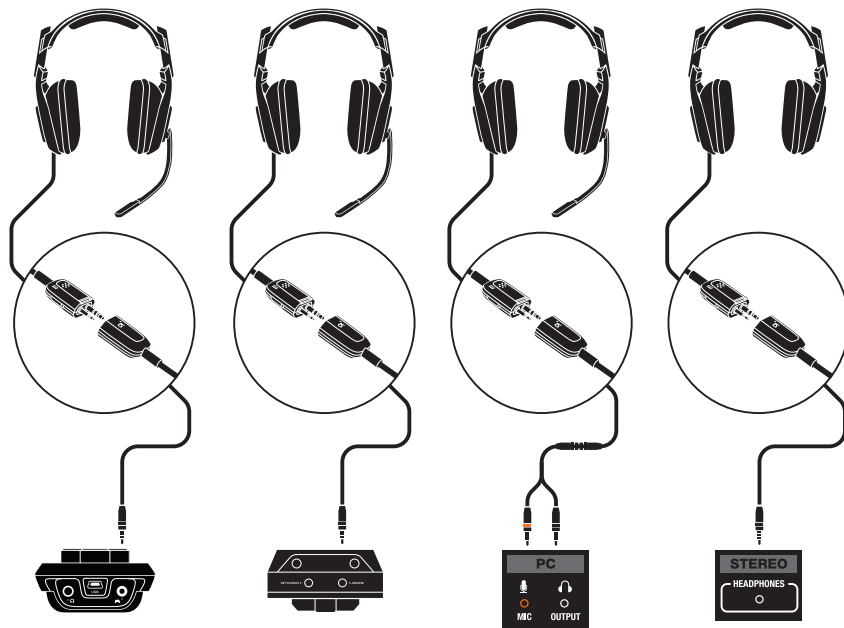
FIG. A (MIXAMP™ 5.8)

The upper part of the Quick Disconnect (attached to the A40 Headset itself) contains a mute control that shuts off any outgoing voice signals. To plug either of the two included headset cables into the QD, make sure you have the 2.5mm and 3.5mm connector jacks properly aligned (one is smaller and one is larger).